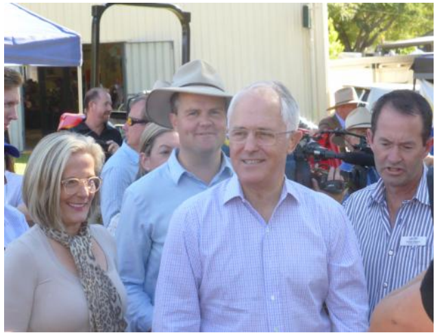
The Country's leader passed by... (you can just see the corner of our tent in the background haha..)