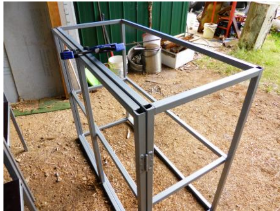
New steel frame Benches for the saw room, with integral Tool cabinet