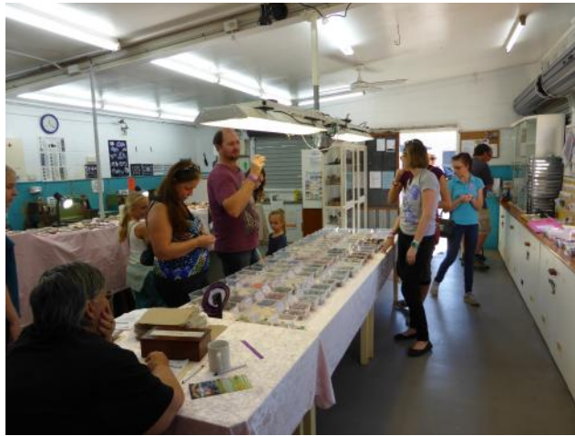
Sales set a record this year, thanks to the 'free day for kids' on Friday.