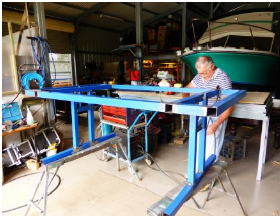
Making the new Tables for the main workshop

We are looking forward to working and playing in the new, well earned, club renovations.