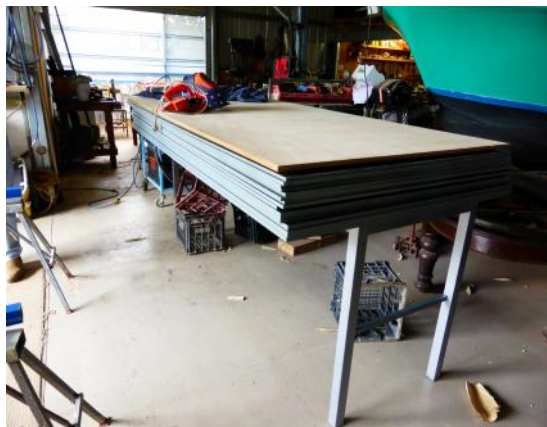
A new table becomes a useful storage area for timber sheets ..... John spraying the finished products