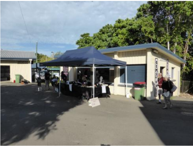
The Club's new 6m x 3m tent makes a great area for the outdoor sales