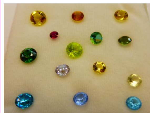
fine Facetted gem samples