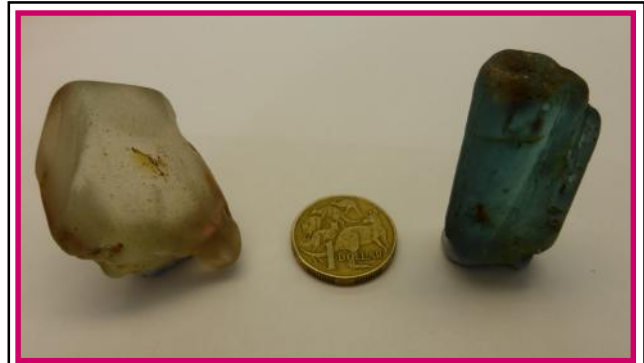
Rare Blue Topaz from N. Queensland Fossicking trip