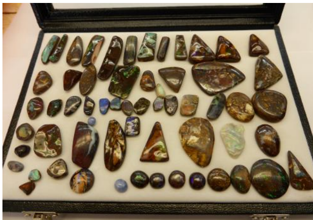
Boulder Opal and freeform gem creations