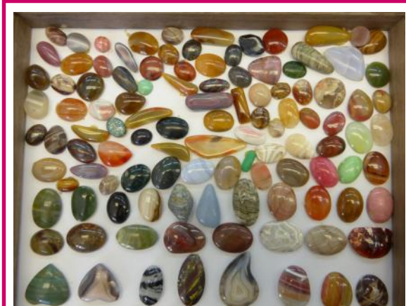
Cabachons from the early days